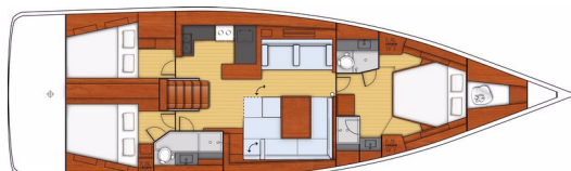
3 cabins + 2 washrooms